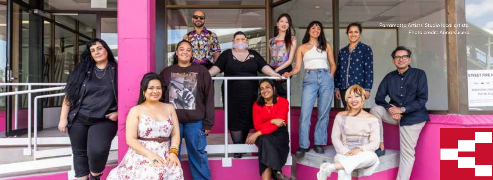
Parramatta Artists' Studio local artists.