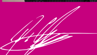
Lord Mayor Cr Pierre Esber