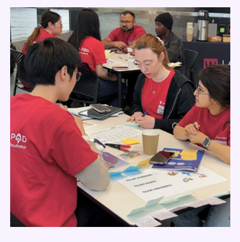
Launch Pad Western Sydney University Launch Pad is an initiative by Western Sydney University that focuses on fostering entrepreneurship, innovation, and industry partnerships in the Western Sydney region.

In Parramatta startups gain access to a supportive ecosystem, a talented workforce, and a vibrant community, all in a strategic and well-connected location. Parramatta is the perfect place to innovate, collaborate, and succeed.